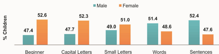
Out of School Children (5-16 Years) - Learning Level (English) by Gender

How to read: 19.7% (8.2+11.5) children can read words in AJK